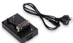
MCE: Single Mains Charger AU, EU, UK, USA